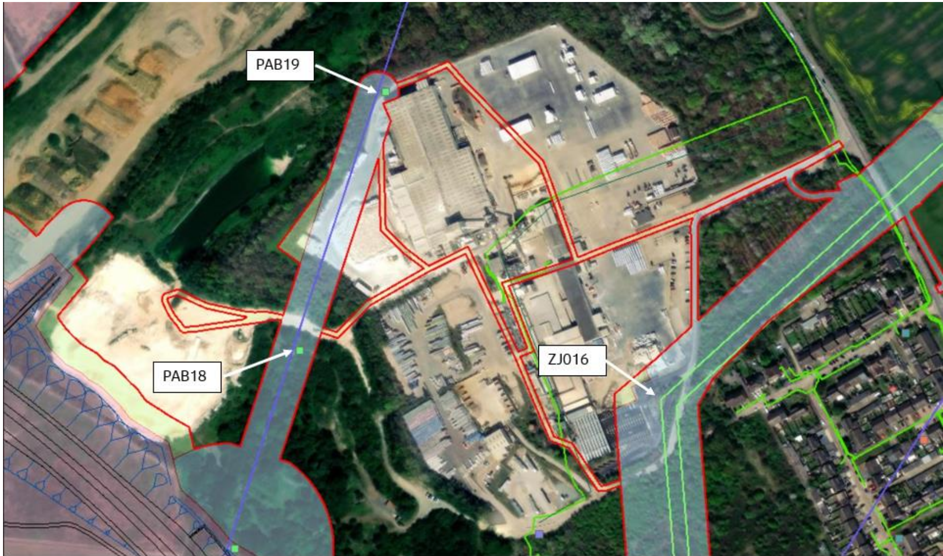
Land Plan (Sheet 27) with Tarmac's Indicative Boundary Overlaid